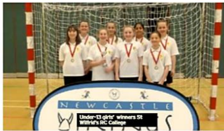
Under-13 girls' winners St Wilfrid's RC College