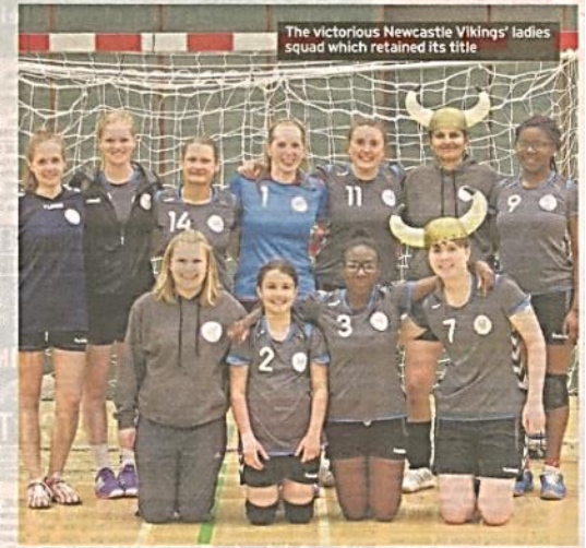
The victorious Newcastle Vikings' ladies squad which retained its title