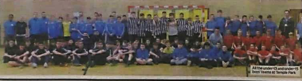
All the under-13 and under-15 boys' teams at Temple Park