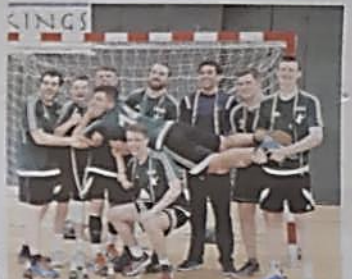
Newcastle Vikings' men's squad in high spirits at the tournament