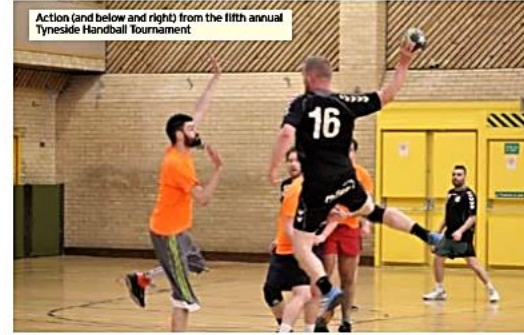
Action (and below and right) from the fifth annual Tyneside Handball Tournament