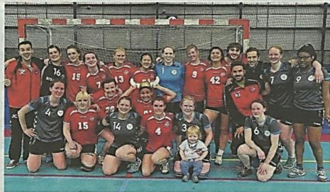
■ The Newcastle Vikings (dark strip) and London GD squads who contested the League Cup final in Manchester (above) and (below) action from the game, which London won 22-14

Without the ability to make any rolling substitutions, though, tiredness began to take its toll on