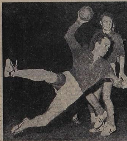
Handball enthusiasts in action.

Training sessions are arranged weekly, starting October 23, 8.30 p.m. to 10 p.m. at Lightfoot Sports Centre, Wharrier Street, Walker (Bus No. 19 and 12). For further information, have a look at the notice-board in the Physical Education Department (later to be moved to the Union Foyer), or contact any of the Norwegian students. The club looks forward to seeing you enjoying the game.