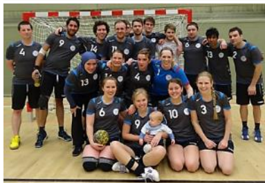
ON THE BALL ... Newcastle Vikings Handball Club's men's and women's teams.

SPORTS fans in South Tyneside will be able to take in the Olympic game of handball for the first time this weekend.