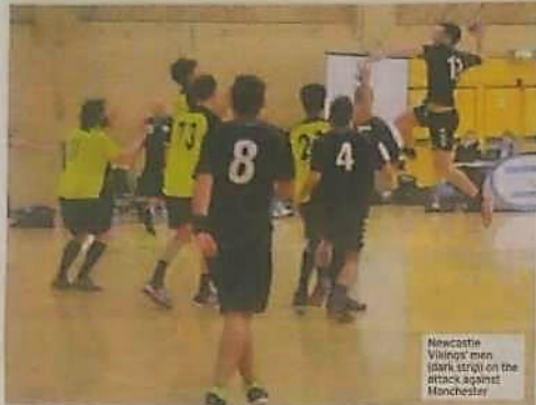
Newcastle Vikings' men (dark) struggle on the attack against Manchester