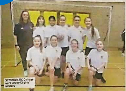
St Wilfrid's RC College were under-13 girls' winners

Go to www.newcastlehandball.co.uk for more details.