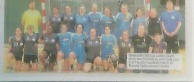
Newcastle Vikings Ladies took a friendly handball match in a friendly handball match at Temple Park Leisure Centre

action and the boys, who ended up on 1-0. The boys' action was rounded off by a friendly match between the Newcastle and Edinburgh women's teams. With the Vikings holding a few less experienced players including girls' fans at their junior's fun run-out in the junior club - Edinburgh were able to win out on advantage right from the start. Newcastle fought back and by half-time were only 2-4 behind. Newcastle's girls were unable to win the Edinburgh girls' match and eventual leading in the final was eventually won by 25-10 at the final whistle.