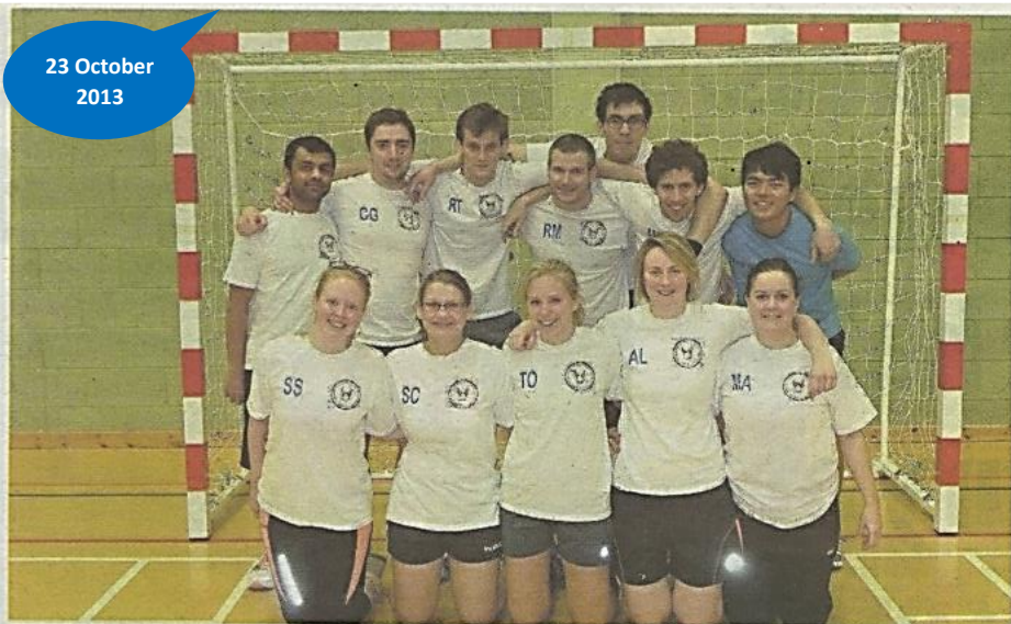
The Newcastle Vikings handball squad (above) which will be playing competitively in Scotland this autumn - just a year after being formed