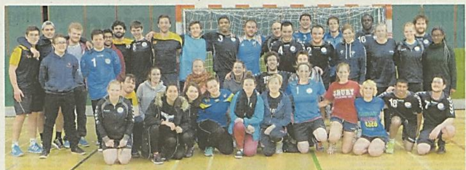
Teams from Newcastle Vikings (black strip), Durham University and York Hunters who took part in the second round of the North East Handball Tournament at Temple Park Leisure Centre

Like us on Facebook facebook.com/eveningchronicle