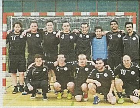
Newcastle Vikings' men's team (above) and (below and bottom) action from their match with Leeds