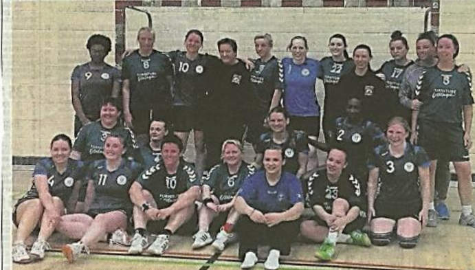
■ Newcastle Vikings Handball Club's women's team who ended their first season in the England Handball North Regional Development League with mixed results in their final two games

The squad scored 256 goals and conceded 240 goals for a +16 goal difference and ended up with 26 points.