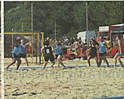
NEWCASTLE Vikings' Handball Club's women's team (in blue) competing in the British Beach Handball Championships, where they endured mixed fortunes