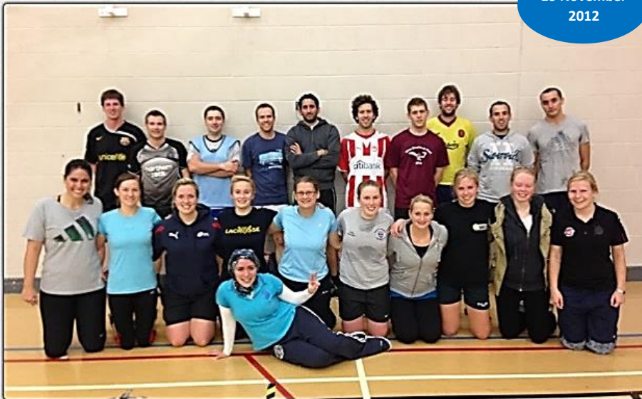
Winners of Handball does Hollywood

Put a smile on your face on Monday afternoon with this great introduction to the game press on the picture to play -