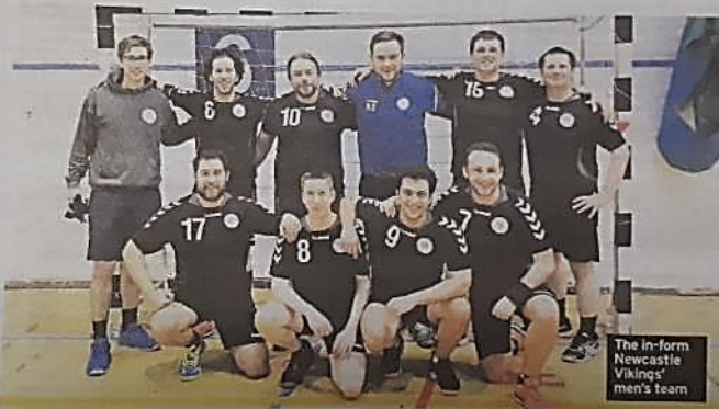
The in-form Newcastle Vikings' men's team

Newcastle's men remain undefeated in the league and jumped above University of Warwick to top spot ahead of their return home game against third-placed University of Leeds on Saturday, March 9 at Temple Park Leisure Centre.