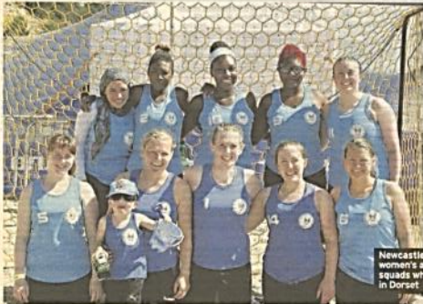
Newcastle Vikings' women's and men's squads who competed in Dorset