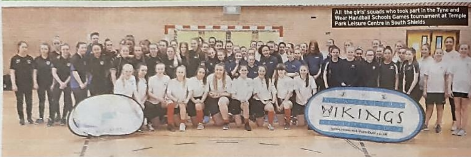
All the girls' squads who took part in the Tyne and Wear Handball Schools Games tournament at Temple Park Leisure Centre in South Shields.

THE 2018 Tyne and Wear Handball Schools Games saw three south-of-the-Tyne schools crowned champions at Temple Park Leisure Centre in South Shields.