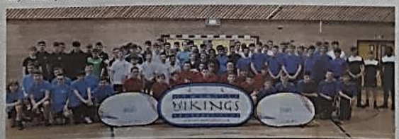
All the teams who took part in the Tyne and Wear Handball Schools Games at Temple Park Leisure Centre

Oxclose Community Academy went unbeaten in winning the under-13 boys' contest ahead of Wellfield Middle School and St Wilfrid's RC College.