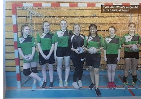
Tyne and Wear's under-16 girls' handball team

TYNE and Wear's under-16 girls team showed a huge improvement in their second round of England Handball north regional competition matches in Chester - despite defeats in their league and friendly games.