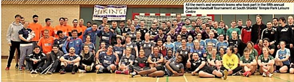
All the men's and women's teams who took part in the fifth annual Tyneside Handball Tournament at South Shields' Temple Park Leisure Centre