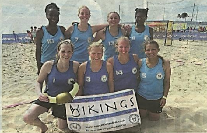
NEWCASTLE Vikings Handball Club's ladies' team which competed at the British Beach Handball Championships in Poole

However, Newcastle were unable to score from their three attempts, Coventry