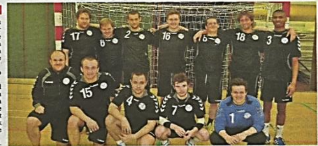
NEWCASTLE Vikings' men's squad also lost narrowly to Manchester in their opening EHNDR League fixture

briefly, only for Newcastle to regain their four-goal advantage through Slinning and Turulska.