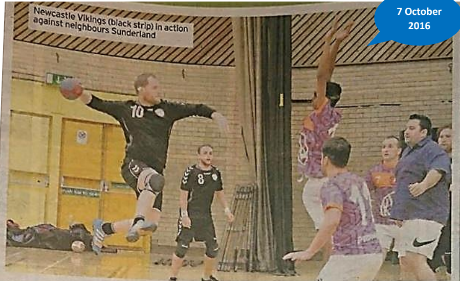
Newcastle Vikings (black strip) in action against neighbours Sunderland