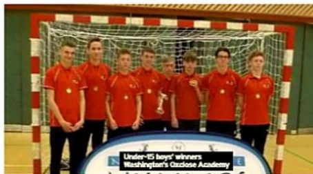
Under-15 boys' winners Washington's Oxclose Academy