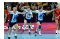
Great Britain's Women's Handball team celebrate a goal against Montenegro at London 2012.

Sunderland University's Handball teams are hoping that the London 2012 Olympic games will encourage more people to become involved in the sport.