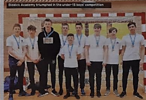
Biddick Academy triumphed in the under-15 boys' competition