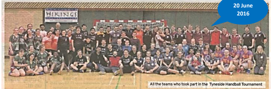
All the teams who took part in the Tyneside Handball Tournament