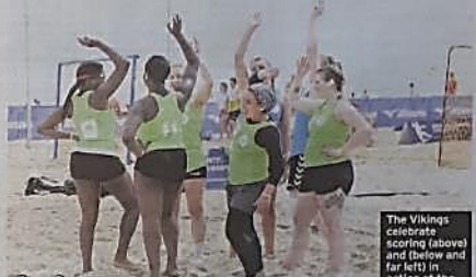
The Vikings celebrate scoring (above) and (below and far left) in action at the championships

point goalkeeper goals of their own GD also took it 16-8 for an overall 2-0 win. The Vikings soon put their game together for a 2-0 victory over Islington Rattas after easily claiming both halves against the North London side 14-4 and 13-7. Newcastle's final two group matches against Chelsea and Poole Phoenix. Three were drawn, each side winning a half to take the games into running penalty shoot-outs. In the Chelsea match the Londoners gained the first half 15-10 - only for Chelsea to prevail in the shoot-out 4-3 for an overall 2-1 victory.