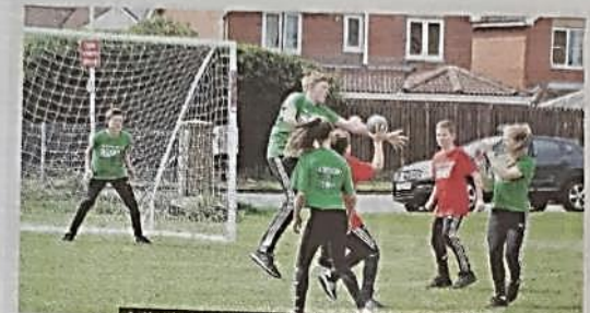
Action from the Northumberland School Games handball tournament at Cramlington Learning Centre