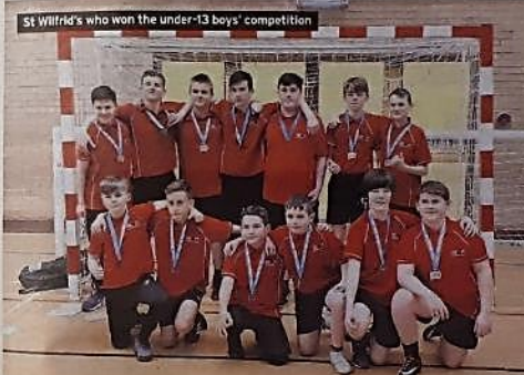
St Wilfrid's who won the under-13 boys' competition