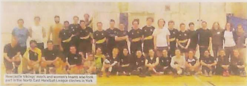
Newcastle Vikings' men's and women's teams who took part in the North East Handball League clashes in York