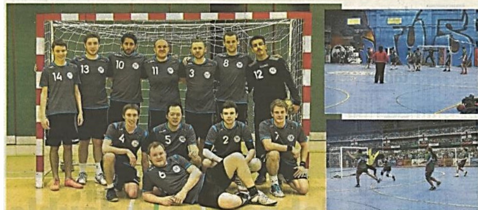
Newcastle Vikings Handball Club's men's squad (above) and (top right and right) action from their league clash with Leeds University which they won 27-20 to make it three league matches unbeaten

Like us on Facebook facebook.com/eveningchronicle