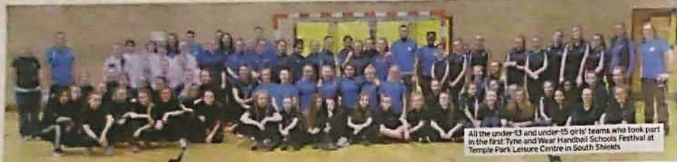
All the under-13 and under-15 girls' teams who took part in the first Tyne and Wear Handball Schools Festival at Temple Park Leisure Centre in South Shields