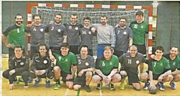
■ Newcastle Vikings' men's team lost its North Development Handball League clash 22-15 to Liverpool

The Vikings are keen to welcome new junior players (10-16