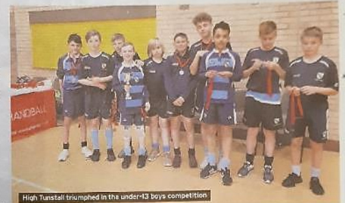
High Tunstall triumphed in the under-13 boys competition

Under-15 girls title winners Oxclose Academy 1. Oxclose 2. Richard Coates 3. High Tunstall 4. St Wilfrid's Under-13 girls title winners St Wilfrid's 1. St Wilfrid's 2. Oxclose 3. High Tunstall 4. Richard Coates Under-15 boys champions Biddick Academy 1. Biddick 2. High Tunstall 3. Oxclose 4. Richard Coates Under-13 boys champions High Tunstall 1. High Tunstall 2. Oxclose 3. Richard Coates 4. Biddick