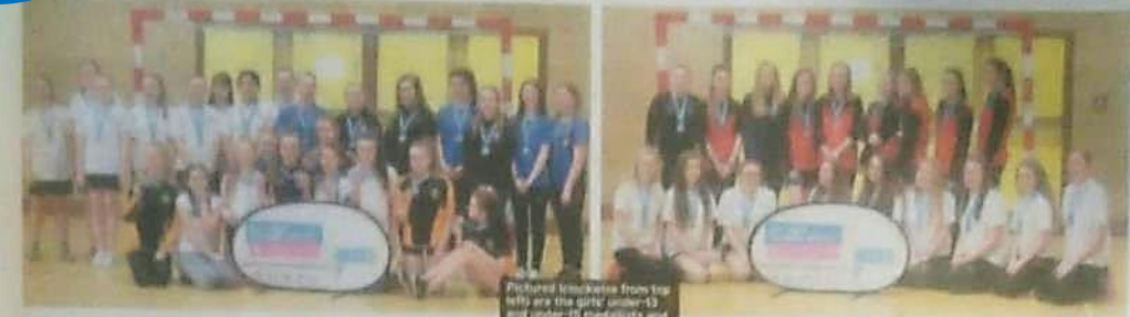
Pictured backstage from top left are the girls' under-15 and under-13 medalists and the boys' under-15 and under-13 medalists