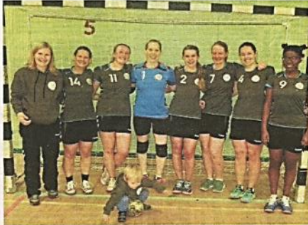
Newcastle Vikings' ladies' team who defeated Leeds in a friendly clash at Temple Park