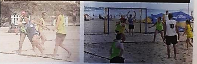
plate competition's third-place trophy for a beat-over seventh-place overall showing at the championships. Their semi-final adversaries West London Eagles went on to beat Coventry Shurks in the women's plate decider, leaving Newcastle's ladies to wonder what might have been. London Angels I defeated London GD II in the main women's cup final. The third-place women's plate trophy nevertheless gave the Vikings their second piece of silverware in their most successful season. It added to their 2017 18 England Handball Women's North Regional League title winners trophy secured in April.