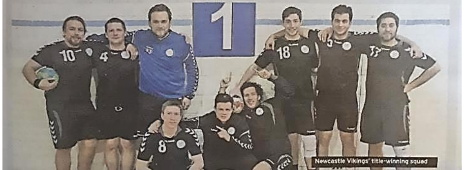
Newcastle Vikings' title-winning squad

Newcastle followed up with a 7-7 draw against Manchester and a 16-14 defeat to the new champions Liverpool to finish their campaign a point behind the University of Leeds in third place.