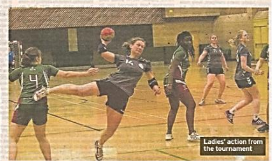
Ladies' action from the tournament