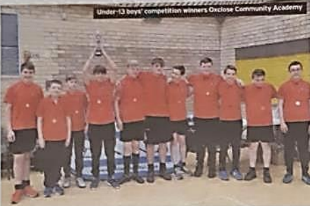
Under-13 boys' competition winners Oxclose Community Academy