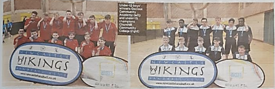
Under-13 boys' winners Oxclose Community Academy (left) and under-15 champions Churchill Community College (right)