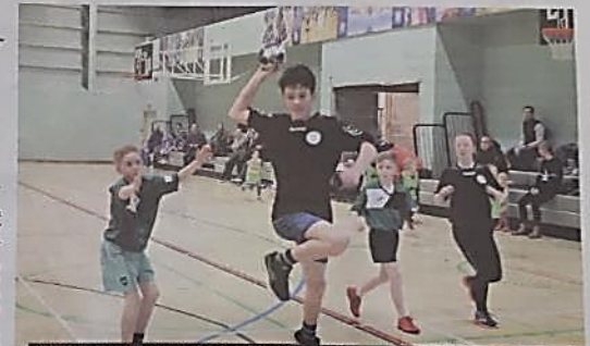
Youngsters in action at Newcastle Vikings Handball Club's fun event at Benfield Centre for Sporting Excellence (also bottom left)

The Vikings would like to thank all those who took part and the volunteers for their hard work on the day.