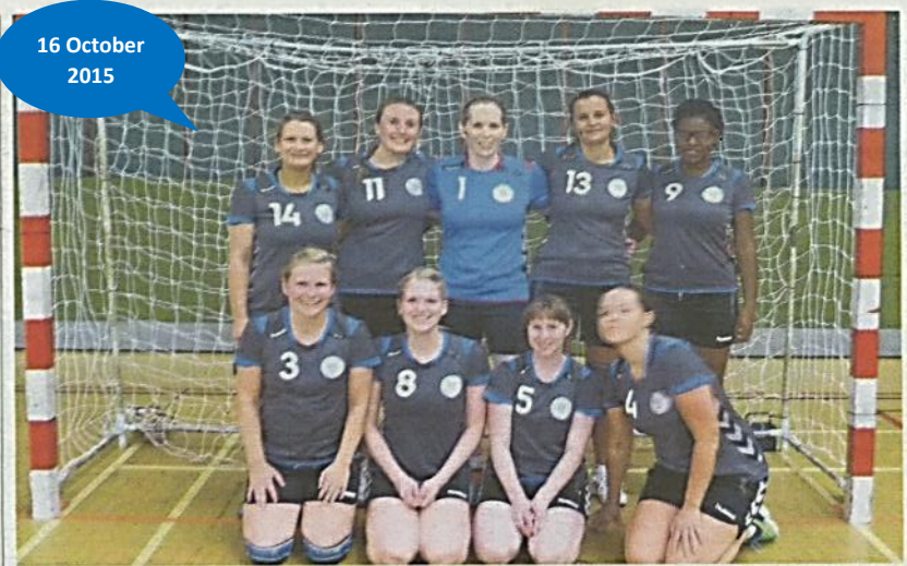
NEWCASTLE Vikings' ladies who lost by one point to Manchester in their opening England Handball North Regional Development League clash