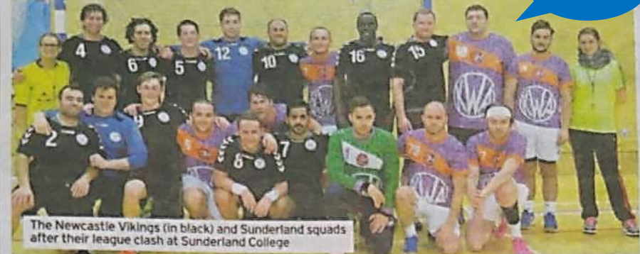
The Newcastle Vikings (in black) and Sunderland squads after their league clash at Sunderland College