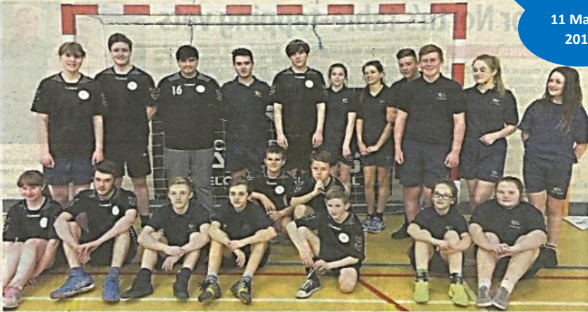
■ Newcastle Vikings Handball Club's mixed junior team (above) which enjoyed an 11-2 victory over North Tyneside's Churchill Community College