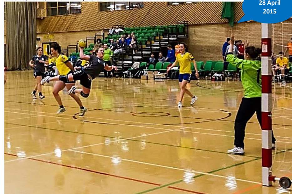
LOOKING BACK ... competitors at last year's event.

AN annual sporting event is getting on the ball to build on its past success.