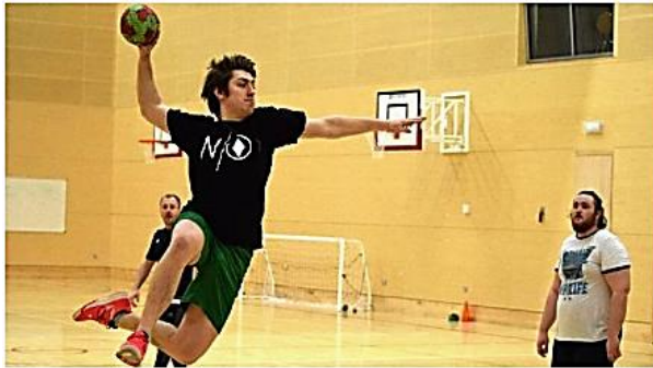
Members of Sunderland Handball Club

The fast-paced, exciting game of handball is new to Sunderland and growing fast!