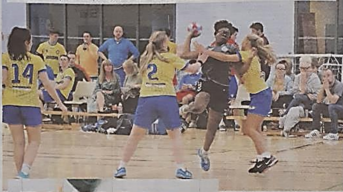
Newcastle Vikings (dark strip) in action at East Kilbride and (below) the victorious squad celebrates