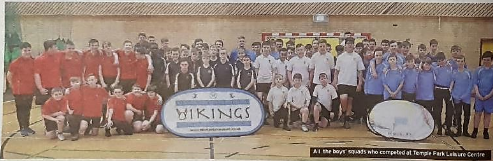
All the boys' squads who competed at Temple Park Leisure Centre