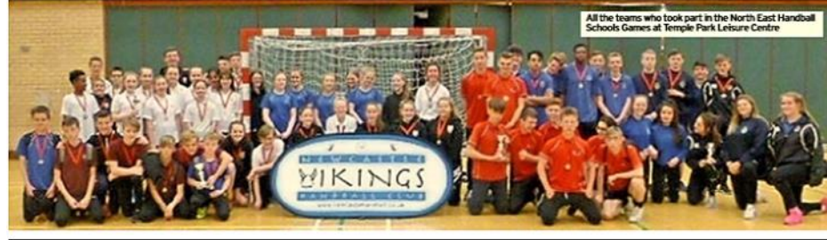
All the teams who took part in the North East Handball Schools Games at Temple Park Leisure Centre