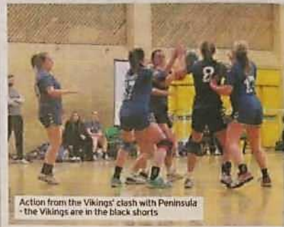
Action from the Vikings' clash with Peninsula - the Vikings are in the black shorts