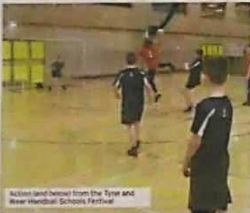
Action (and below) from the Tyne and Wear Handball Schools Festival