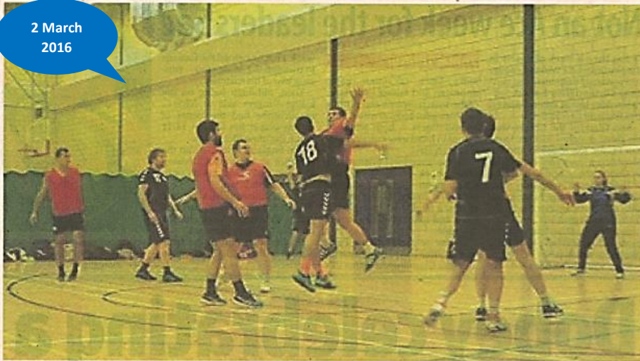
■ Newcastle Vikings (black strip) in action in the third round of the inaugural North East Handball Tournament, which they ended up winning