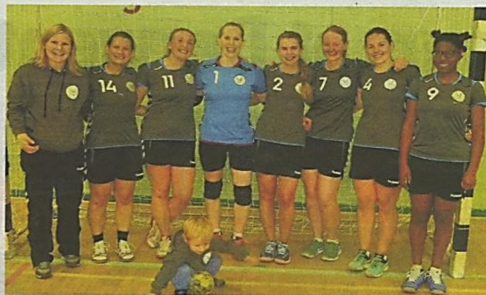
■ Newcastle Vikings' ladies team made it three league wins in a row by beating Merseyside club Peninsula

That made it three wins in a row and pushed the Vikings up to second in the league table.