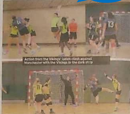
Action from the Vikings' ladies clash against Manchester with the Vikings in the dark strip