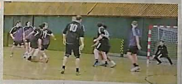
■ Newcastle Vikings (dark strip) in action during their league clash with Leeds Carnegie at Temple Park

position and player-coach Jonathian Ilastit each struck twice to round off an emphatic 31-19 victory.