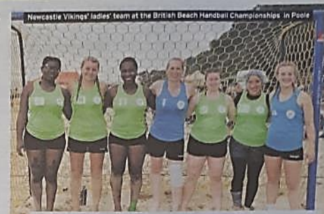
Newcastle Vikings' ladies' team at the British Beach Handball Championships in Poole

NEWCASTLE Vikings' ladies suffered the curse of multiple penalty shoot-out heartbreaks at the British Beach Handball Championships in Poole. The annual tournament, now in its seventh year at Bournemouth's Chiswick beach, saw a depleted Newcastle team looking to better last year's third place in the plate competition.