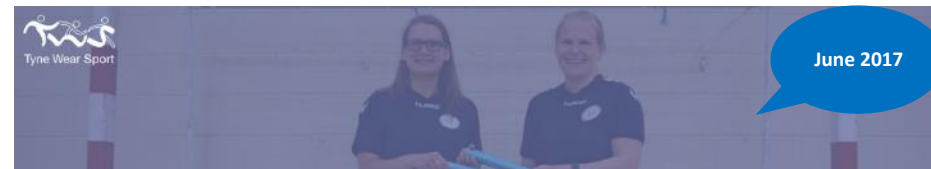
Newcastle Vikings Handball Club