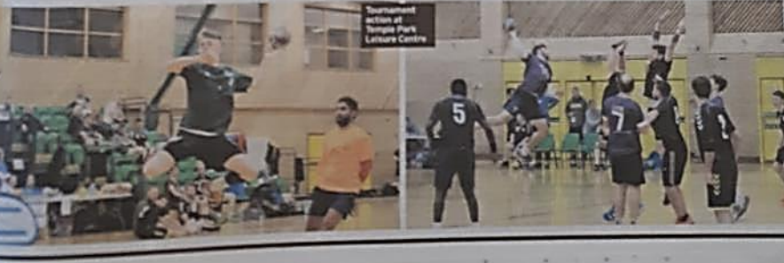
Tournament action at Temple Park Leisure Centre