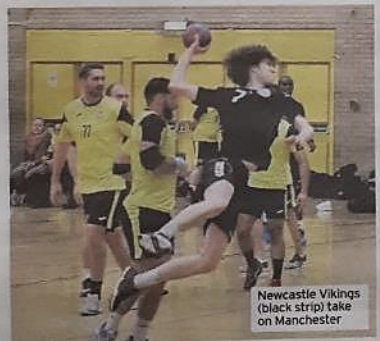
Newcastle Vikings (black strip) take on Manchester

In a low-scoring first half of the women's game, dominated by tight defence lines and great saves from