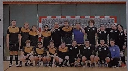
Newcastle Vikings' (all-black strip) and University of York's men's handball teams who met in a North East Friendly League clash at South Shields' Temple Park Leisure Centre