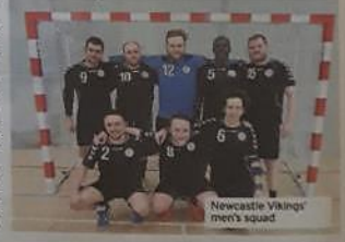
Newcastle Vikings men's squad