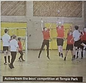
Action from the boys' competition at Temple Park

RESULTS - Girls Under-13: Castle View 12-0 Walbottle, St Wilfrid's 8-4 Churchill, Church Hill 1-0 Castle View, Walbottle 0-12 St Wilfrid's, Churchill 8-0 Walbottle, St Wilfrid's 4-1 Castle View. Girls Under-15: St Wilfrid's 2-1 John Spence, Oxclose 4-1 Walbottle, John Spence 2-2 Oxclose, Walbottle 2-6 St Wilfrid's. John Spence 6-2 Walbottle, St Wilfrid's 6-1 Oxclose. Boys Under-13: Walbottle 1-1 Churchill, Oxclose 4-1 St Wilfrid's, Oxclose 7-1 Walbottle, Churchill 1-3 St Wilfrid's, Churchill 4-4 Oxclose, St Wilfrid's 11-3 Walbottle. Boys Under-15: Biddick 3-0 Boldon, Walbottle 5-0 Churchill, Biddick 8-3 Walbottle, Churchill 1-3 Boldon, Churchill 6-7 Biddick, Boldon 1-3 Walbottle.