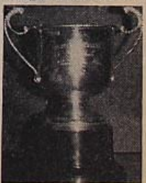
The Handball Challenge Cup

The final score board was: P W D L Pts. 1 Newcastle U. 5 5 0 0 10 2 Sid. Tech. Col. 5 4 0 1 8 3 Q's Un., Bifst. 5 3 0 2 6 4 Heriot Watt U. 5 2 0 3 4 5 Strathclyde U. 5 1 0 4 2 6 Glasgow Uni. 5 0 0 5 0