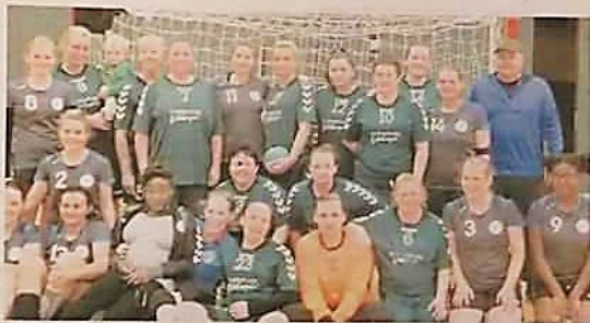
Newcastle Vikings' ladies team (in darker strip) with Liverpool Ladies (Green) before their league clash at Temple Park

Goalkeeper Andrea King pulled off a series of great saves as the away