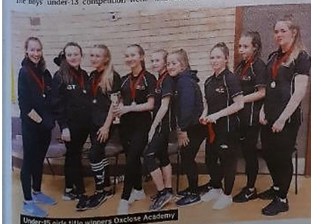
Under-15 girls title winners Oxclose Academy