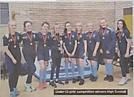
Under-13 girls' competition winners High Tunstall

tle for the boys' under-15 title. The North Tyneiders followed a 2-2 draw with a 4-2 win over High Tunstall. The winning teams will now represent the North East region at the England Handball Association's National Schools Games Finals next month. Newcastle Vikings would like to thank all the schools for participating as well as Tyne and Wear Sport and students from TyneMet College's North East Sports Academy for helping to run the tournament.