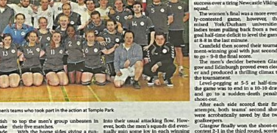
Newcastle Vikings' men's and women's teams who took part in the action at Temple Park.

HANDBALL GLASGOW'S men retained their Tyneside Handball tournament crown and Bedfordshire's Cranfield University Wolves claimed the women's title at Temple Park Leisure Centre in South Shields. Hosted by Newcastle Vikings Handball Club, the end-of-season tournament - now in its third year - welcomed teams from across England and Scotland. The early group matches were all close-fought affairs before the three experienced Scottish men's teams picked up the pace and began to rack up big scores. Edinburgh claimed the biggest win of the day in beating York Hunters 18-2 before East Kilbride's EK22 defeated Newcastle's second team 18-4. The day's highest-scoring match