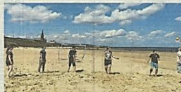
■ The Vikings prepare for this weekend's British Championships

Beach handball, also known as 'sandball', is played on a