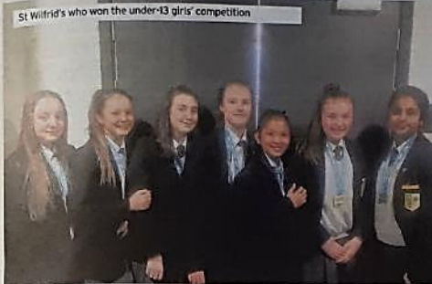
St Wilfrid's who won the under-13 girls' competition