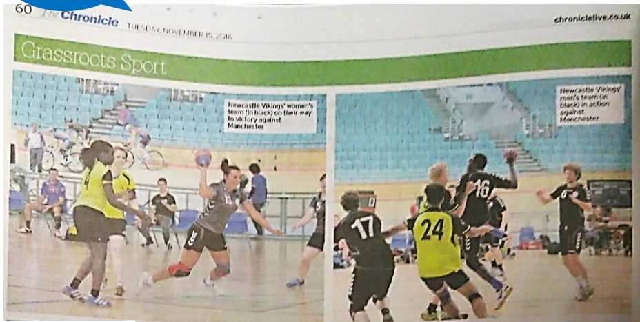
Newcastle Vikings' women's team (in black) on their way to victory against Manchester