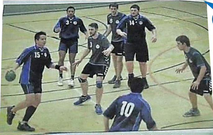
Dundee Handball Club (blue) in action against Newcastle in a Scottish Division Two encounter at DISC. See below.