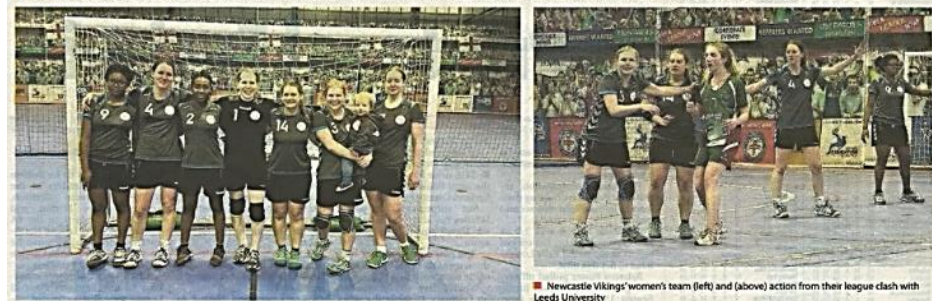
Newcastle Vikings' women's team (left) and (above) action from their league clash with Leeds University