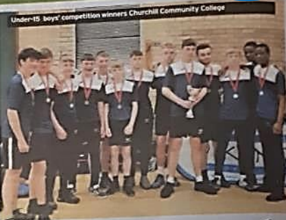
Under-15 boys' competition winners Churchill Community College