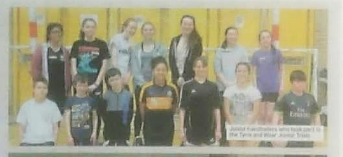
Junior handballers who took part in the Tyne and Wear Junior Trials

JUNIOR handballers took the spotlight at Temple Park Leisure Centre in South Shropshire. More than 20 girls and boys gathered for the 2017 round of the Tyne and Wear County Handball Trials - all vying to be selected for a place in the first under-15 county teams. They were followed by a joint final round of under-15 girls and boys between teams of Newcastle Vikings' handball players. The winners emerged with 10 and 4-1 with some of the best and greatest players in action. The girls defeated the boys 1-0. The girls won Tuesday then won 4-1 against the boys in the final. It was the girls who won the County Handball Trials on the 19th April. The winners will progress with the competition with 10 girls and 4 boys.