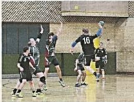
More action from the Newcastle-Leeds game at Temple Park