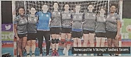
Newcastle Vikings' ladies team