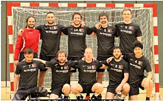
Hosts Newcastle Vikings' men's and women's teams at South Shields