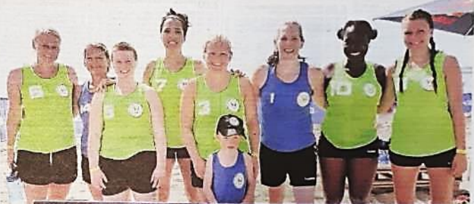
The Newcastle Vikings' squad which took part in the British Beach Handball Championships in Poole (above) and (below left and below right) the team in action