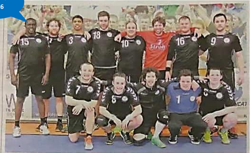
■ Newcastle Vikings' men's squad who enjoyed a double success over Leeds opposition in the England Handball North Regional League