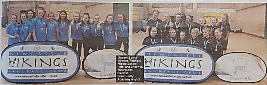
Under-13 girls' winners Wellfield Middle School (left) and under-15 champions Oxclose Community Academy (right)