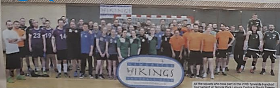
All the squads who took part in the 2018 Tyneside Handball Tournament at Temple Park Leisure Centre in South Shields