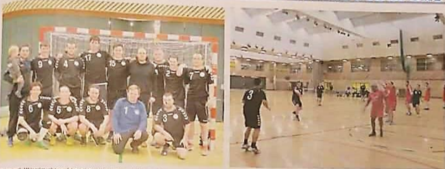
Newcastle Vikings men's team (above left) who lost to Liverpool Speke in the Northern Regional Development Handball League and (above right) action from the game at Temple Park in South Shields