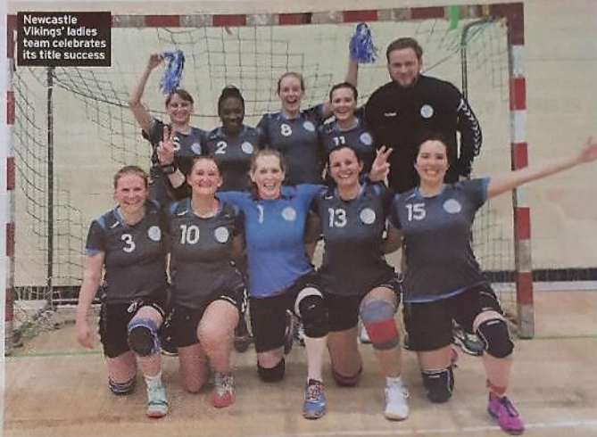
Newcastle Vikings' ladies team celebrates its title success