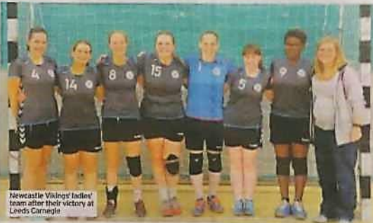
Newcastle Vikings' ladies' team after their victory at Leeds Carnegie

However, while the defence line remained solid, in taking the opportunity to experiment with positional changes the Vikings seemed to lose some of their attacking flow and shooting accuracy.