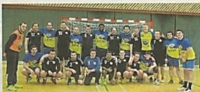
Newcastle Vikings (in black) and Fulham Hawks pictured before their Cup clash

NEWCASTLE Vikings' men's team was knocked out of the England Handball League Cup at the first-round stage 35-15 by Fulham Hawks at Temple Park Leisure Centre in South Shields.