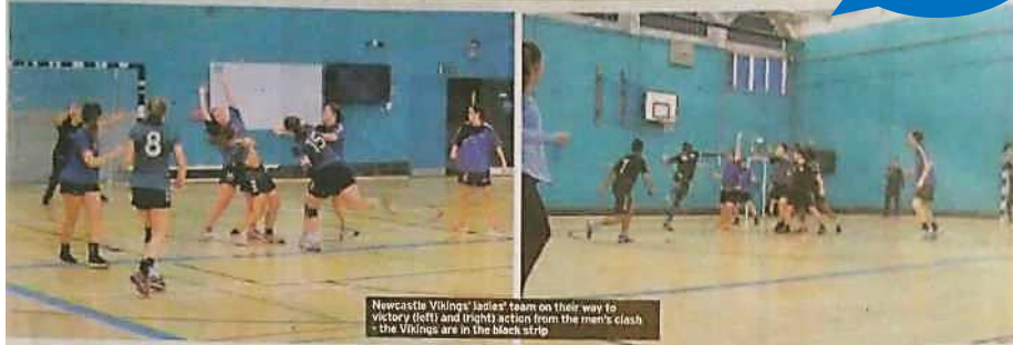
Newcastle Vikings' ladies' team on their way to victory (left) and (right) action from the men's clash - the Vikings are in the black strip