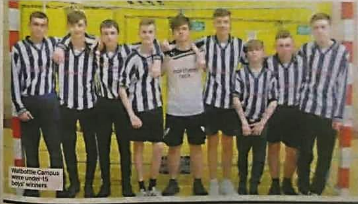
Walbottle Campus were under-15 boys' winners