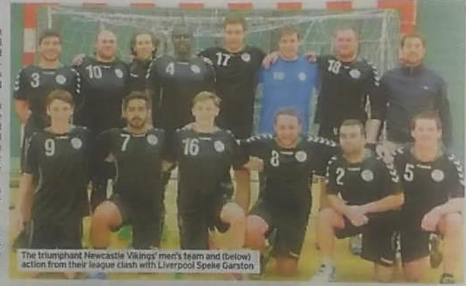
The triumphant Newcastle Vikings' men's team and (below) action from their league clash with Liverpool Speke Garston