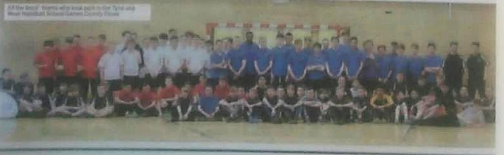
All the boys' teams who took part in the Tyne and Wear Handball School Games County Finals