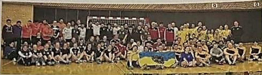
The teams who took part in the 2014 Vikings handball tournament taken and right action from the event. This year's tournament is held in South Shields this weekend.