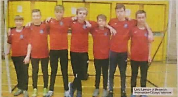
Lord Lawson of Beamish were under-13 boys' winners