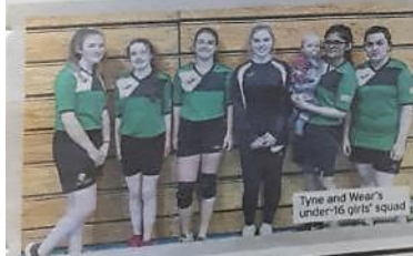
Tyne and Weir's under-16 girls' squad