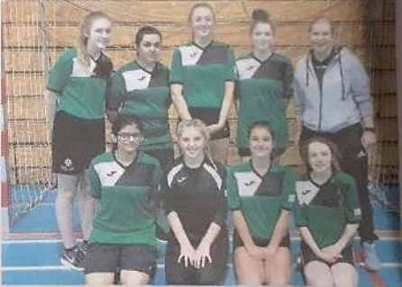
The Tyne and Wear under-16 girls' handball team which competed in Chester