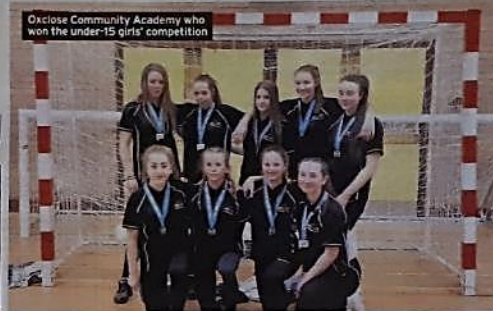
Oxclose Community Academy who won the under-15 girls' competition