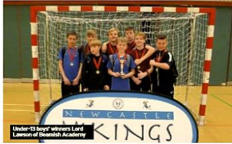
Under-13 boys' winners Lord Lawson of Beamish Academy

The winning schools go on to represent the North East at the English Schools Handball