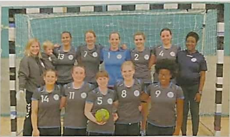
Newcastle Vikings' ladies squad in all smiles after coming from behind to beat Manchester Hawks in the English Regional Handball League