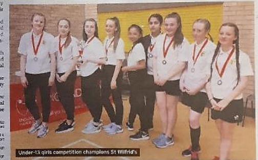
Under-13 girls competition champions St Wilfrid's