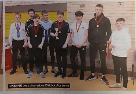
Under-15 boys champions Biddick Academy