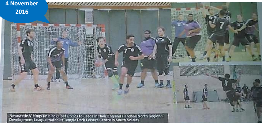
Newcastle Vikings (in black) lost 25-23 to Leeds in their England Handball North Regional Development League match at Temple Park Leisure Centre in South Shields.