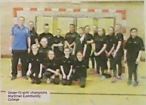
Under-15 girls' champions Mortimer Community College