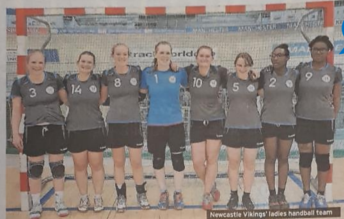
Newcastle Vikings' ladies handball team