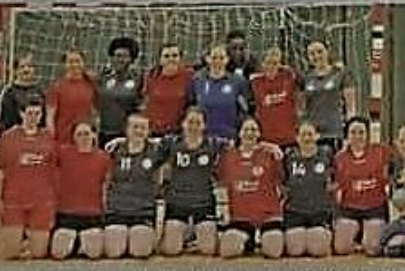
The Vikings' ladies team celebrate after securing a place in the League Cup final by beating Broom 15-11.

HANDBALL ...and they and their sport great hand... ...This is a great opportunity to compete and watch the games live on TV... ...The Vikings tournament will see Newcastle Vikings men take on teams from Durham, York, East Kilbride, EK22 and Edinburgh as well as competing against Glasgow. ...In the women's competition, the Vikings ladies will be looking to defend their title against Glasgow, Edinburgh and Dundee. ...For anyone interested in getting involved and getting a go at playing handball, Newcastle Vikings junior and adult teams meet on Monday evenings at Temple Park Leisure Centre and on Wednesday evenings at the Percy Hedley Sports Academy in R20, Newcastle. ...I have a few teams looking for more and further information can be found on the club's website www.vikingshandball.co.uk or by their Facebook page.