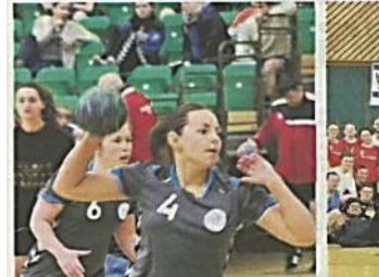
The teams who took part in the Newcastle Vikings handball tournament at South Shields Temple Park Leisure Centre (above) and (left and right) action from the women's and men's competitions.