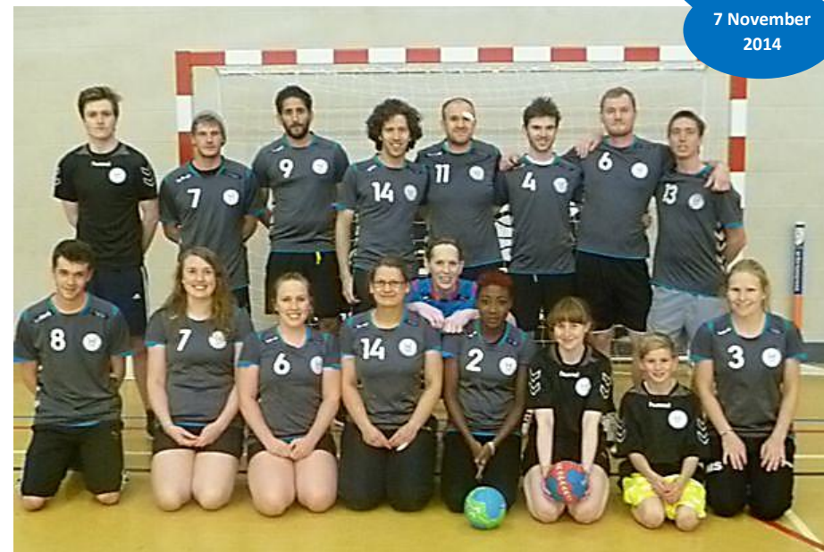
Some senior and junior members of the Newcastle Vikings Handball Club

The Newcastle Vikings Handball Club Juniors cater for ages 10-16 years and their Seniors start from 17 years upwards.