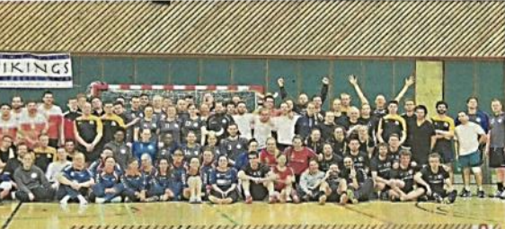
The teams who took part in the Newcastle Vikings handball tournament at South Shields Temple Park Leisure Centre (above) and (left and right) action from the women's and men's competitions.

HANDBALL GLASGOW'S men retained their Tyneside Handball tournament crown and Bedfordshire's Cranfield University Wolves claimed the women's title at Temple Park Leisure Centre in South Shields. Hosted by Newcastle Vikings Handball Club, the end-of-season tournament - now in its third year - welcomed teams from across England and Scotland. The early group matches were all close-fought affairs before the three experienced Scottish men's teams picked up the pace and began to rack up big scores. Edinburgh claimed the biggest win of the day in beating York Hunters 18-2 before East Kilbride's EK22 defeated Newcastle's second team 18-4. The day's highest-scoring match