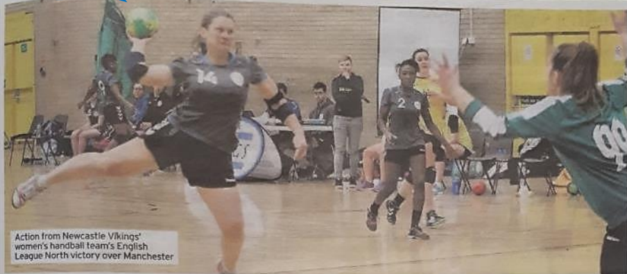
Action from Newcastle Vikings' women's handball team's English League North victory over Manchester