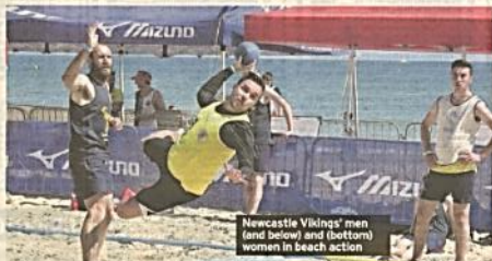
Newcastle Vikings' men (and below and bottom) women in beach action

The second day of action saw an early start for the Vikings' women, drawn to play a Cup qualifier match against London's Olympia. However, a 13-7, 12-11 defeat meant they dropped into the second-tier plate competition. Newcastle then scored their first 2-0 match victory in the quarter-final against hometown favourites Poole Phoenixes 8-5, 19-7. However, they then came up against Oxford Blues again in the semi-final, narrowly losing the first half 13-12 and then 15-6 in the second half as injuries and tiredness took their toll. The Sandcastles men went into their Cup quarter-final with a further depleted team of just five players - so it was always going to be an uphill struggle as they were also knocked out by Oxford Blues 18-10 20-15. The men's tournament was ultimately won by guest Dutch team Heikka Hauskaa as London GD retained the women's cup against Poole Phoenixes II. Brighton beat London GD in the men's plate final while Oxford Blues went on to win the women's plate.