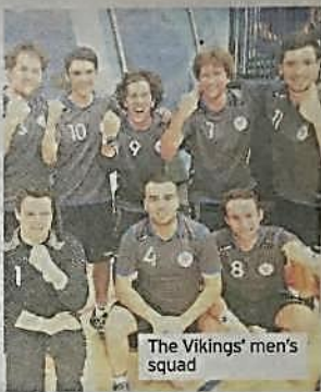
The Vikings' men's squad

■ It was a tough opening to the England Handball North Regional Development League season for Newcastle