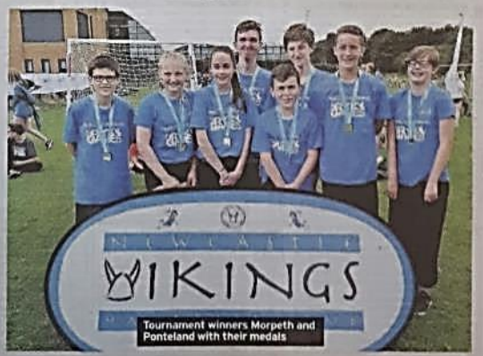
Tournament winners Morpeth and Ponteland with their medals

RESULTS: Ashington and Coquet 4, Blyth and Bedlington 1, Cramlington and Seaton Valley 3, Morpeth and Ponteland 6, North Northumberland 4, Ashington and Coquet 4, Blyth and Bedlington 1, Tynesdale 2, Cramlington and Seaton Valley 1, Tynesdale 4, Morpeth and Ponteland 10, North Northumberland 2, Ashington and Coquet 1, Morpeth and Ponteland 6, Blyth and Bedlington 3, Cramlington and Seaton Valley 7, North Northumberland 4, Cramlington and Seaton Valley 4, Tynesdale 6, Ashington and Coquet 3, North Northumberland 2, Cramlington and Seaton Valley 4, Morpeth and Ponteland 8, Tynesdale 3, Ashington and Coquet 4, Cramlington and Seaton Valley 5, Blyth and Bedlington 1, Morpeth and Ponteland 7, and North Northumberland 2, Tynesdale 7.