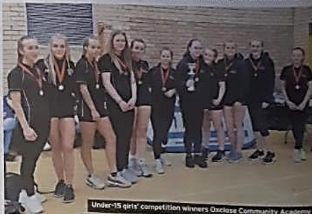
Under-15 girls' competition winners Oxclose Community Academy