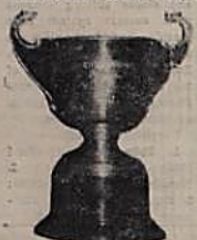
The winning trophy.

NEWCASTLE University are the Handball Champions of British Universities. They won the Championship last term, and last week-end successfully defended their trophy in Edinburgh.