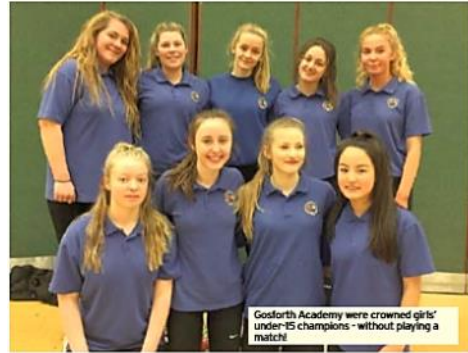
Gosforth Academy were crowned girls' under-15 champions - without playing a match!