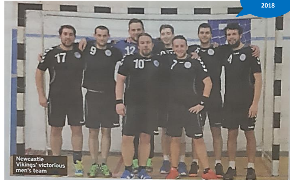
Newcastle Vikings' victorious men's team