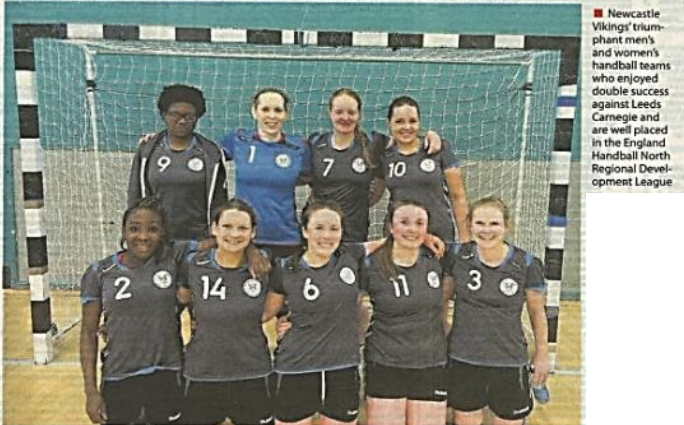
■ Newcastle Vikings' triumphant men's and women's handball teams who enjoyed double success against Leeds Carnegie and are well placed in the England Handball North Regional Development League